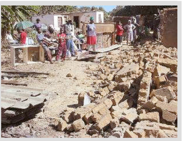
Family Demolishes own house in Epworth, Harare.