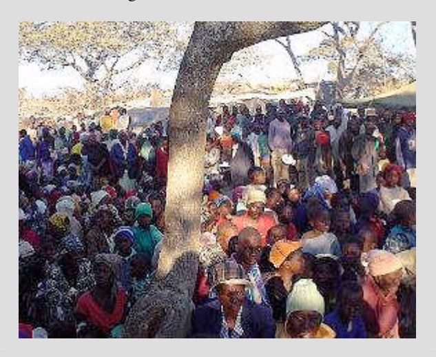
Over 4,000 people in Caledonia Transit Camp.