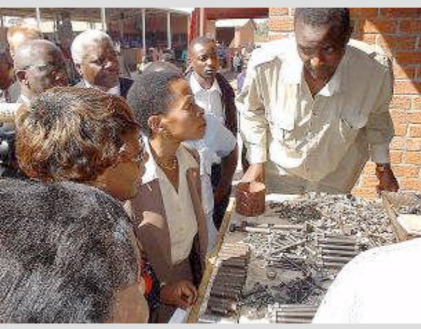
Visiting new stalls for informal traders, Harare.