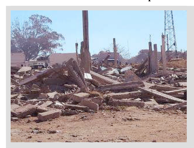
Market stalls demolished in Mbare, Harare.