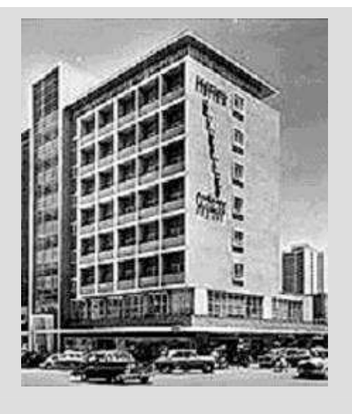
Salisbury: the exclusive colonial city.