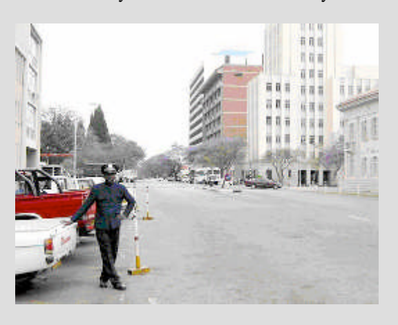
1990's Harare: city of boulevards and clean streets.