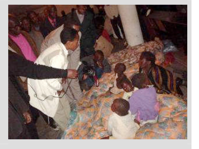
Interviewing families, Agape Mission Church, Bulawayo.