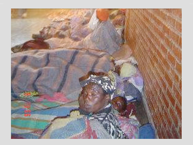
Sheltering in Agape Mission Church, Bulawayo.