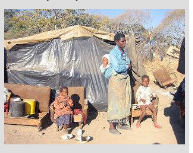
Makeshift shelter in Caledonia Transit Camp.