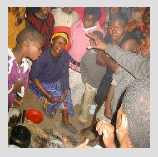
Interviewing woman living in the open, Mutare.