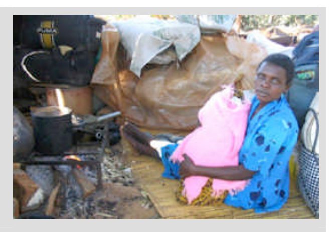
Mother living in the open in Porta Farm, June 30, 2005.