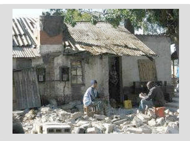
Living amidst the rubble in Mbare.