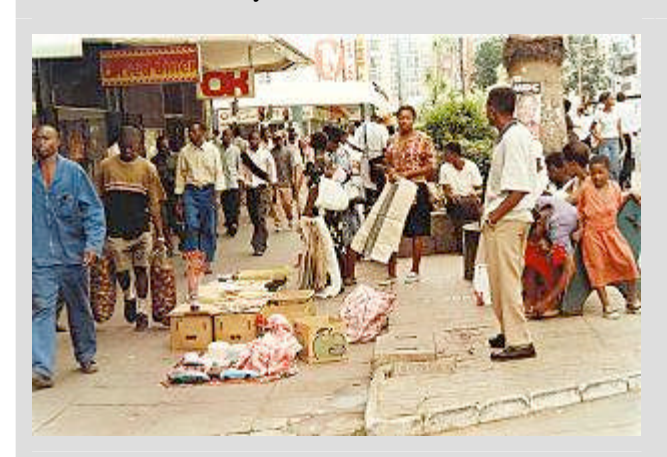
Harare: before Operation Murambatsvina .