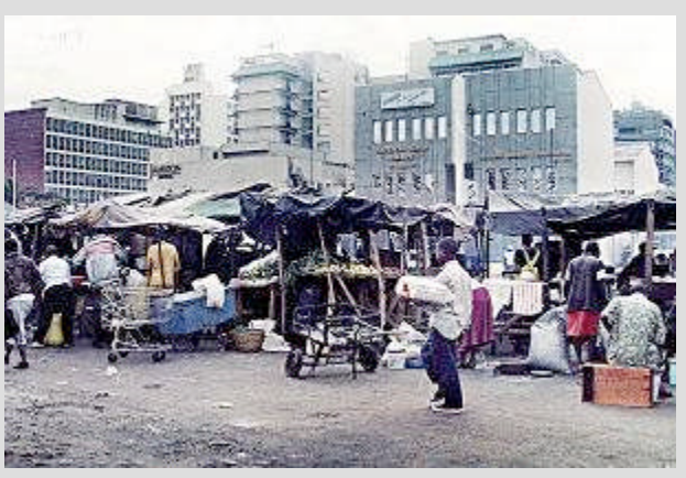
Harare: before Operation Murambatsvina.