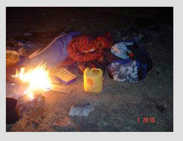
Sleeping out at Sakubva Sports Oval Camp, Mutare.