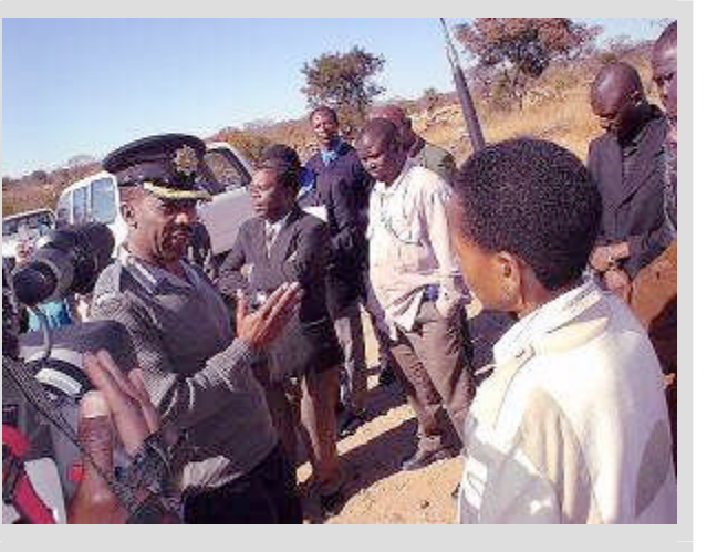
Being briefed about Ngozi demolitions, Bulawayo.