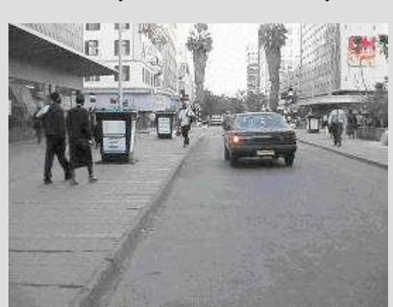
1990's Harare: city of boulevards and clean streets.