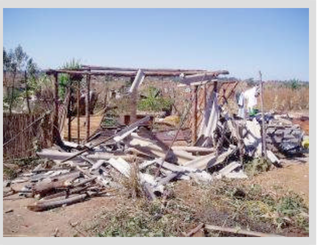
Demolished house at Hatcliffe.