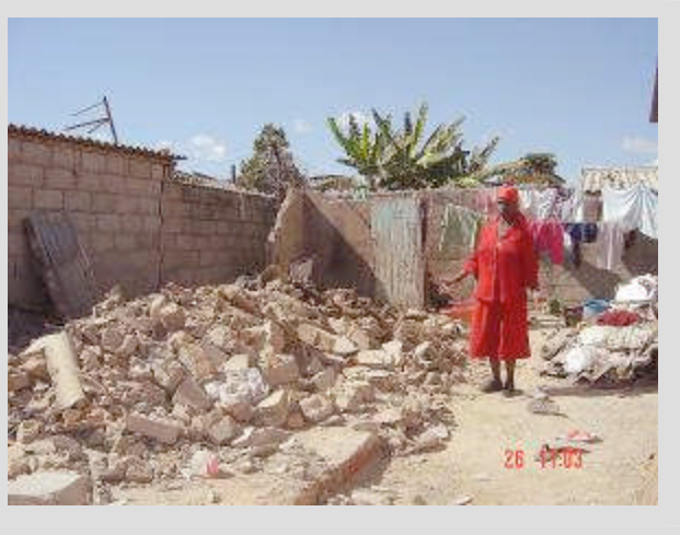
Backyard demolition in Chitingwiza, Harare.