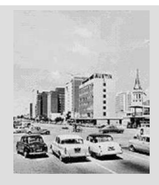
Salisbury: the exclusive colonial city.